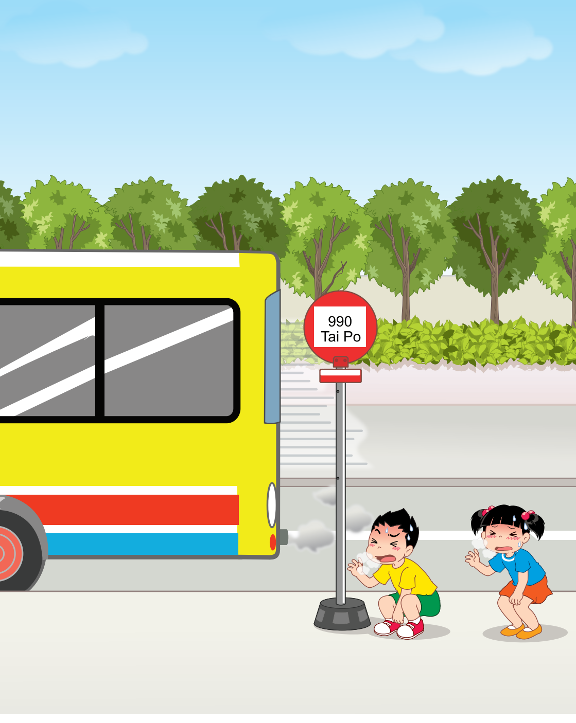
The bus is going!