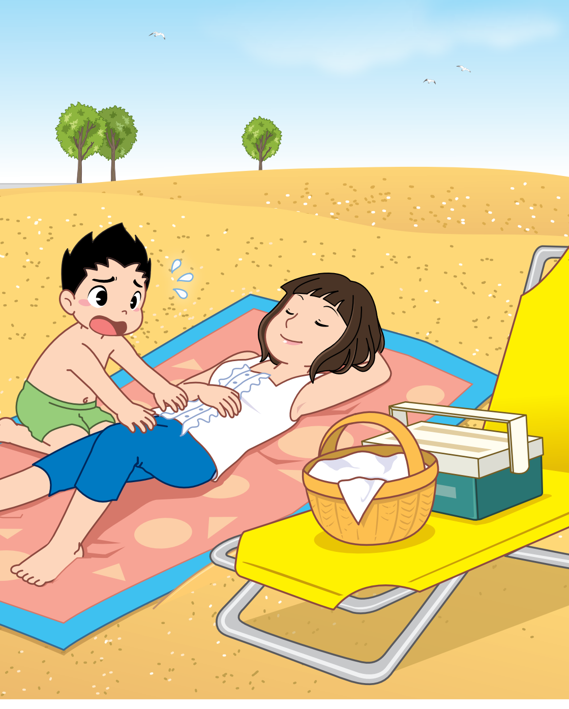
Wake up, Mum!