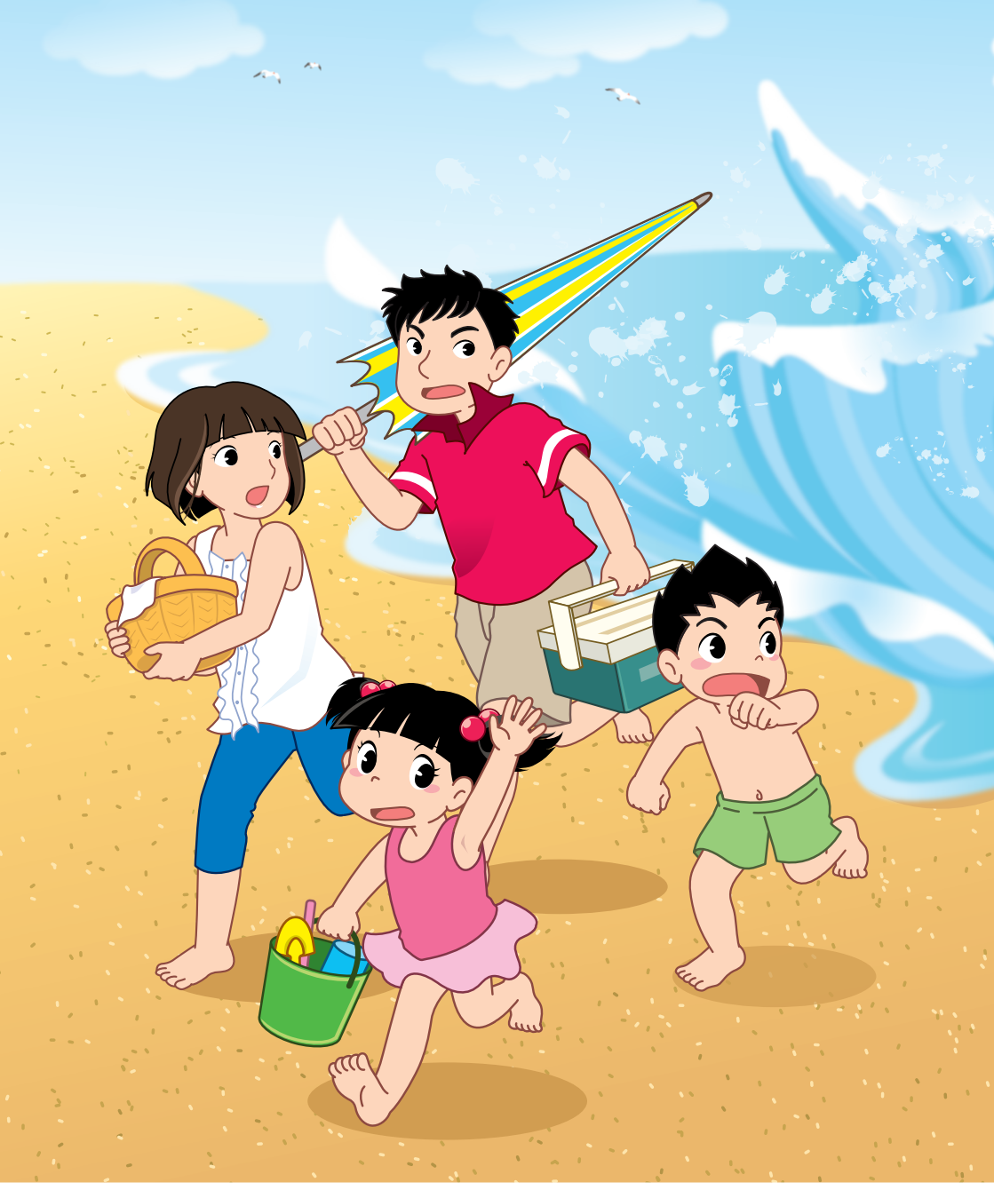
The water is coming. We are running.