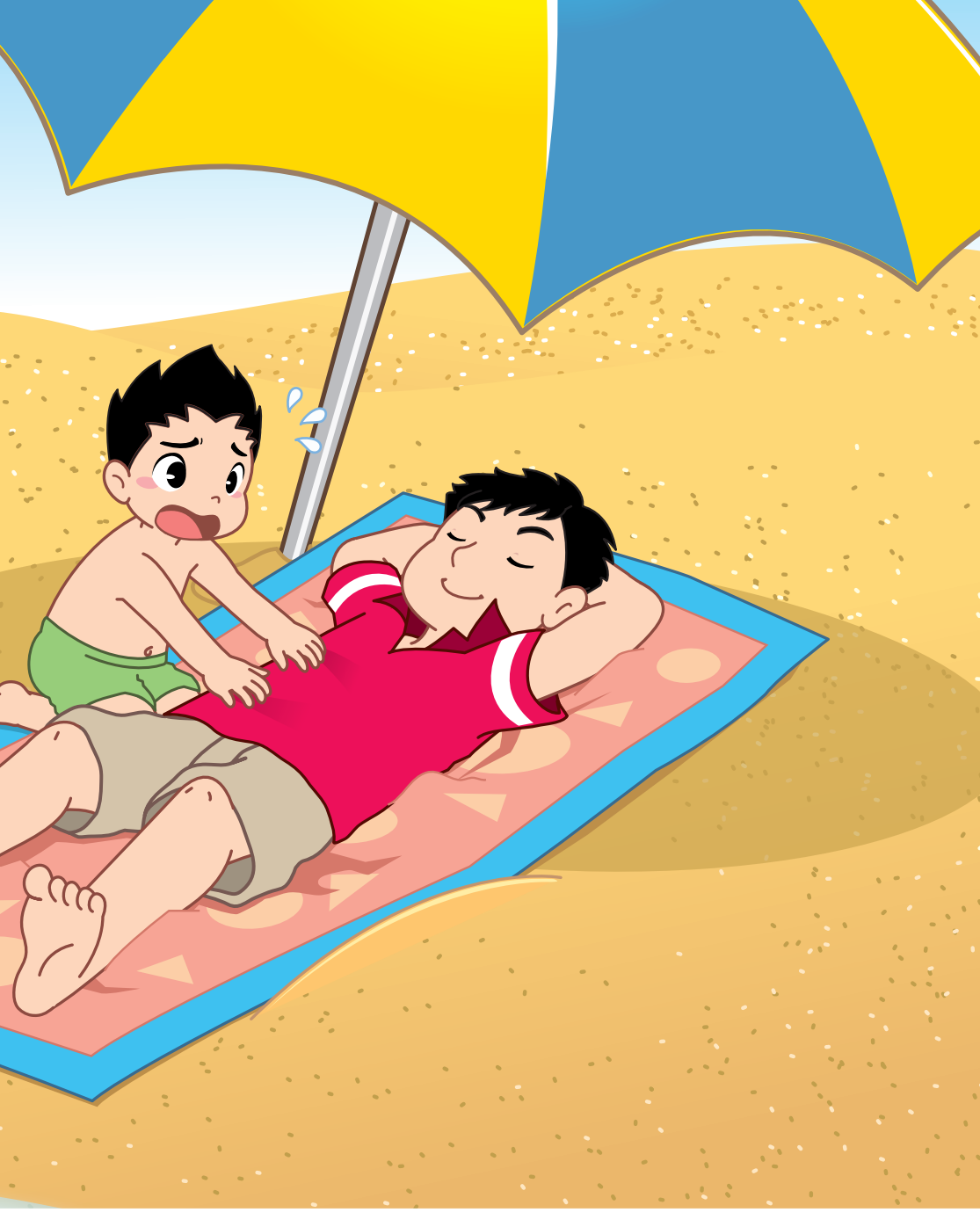
Wake up, Dad!