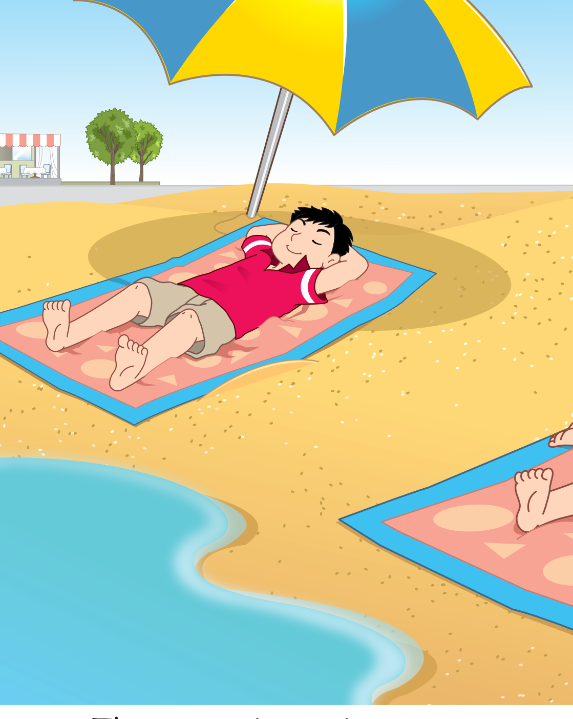
The water is coming.