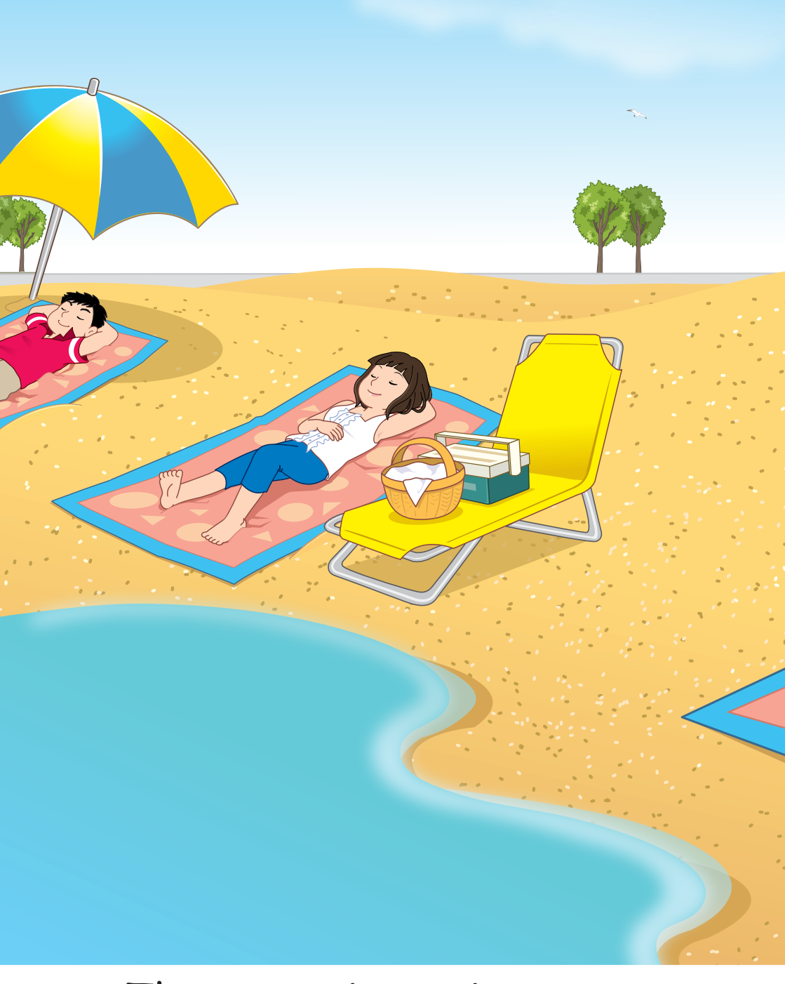
The water is coming.