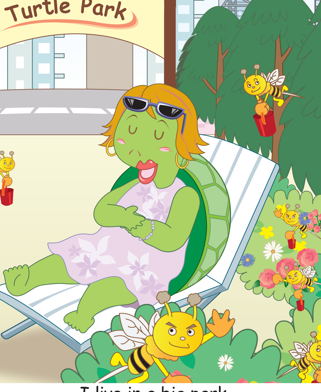
I live in a big park. It has many bees.