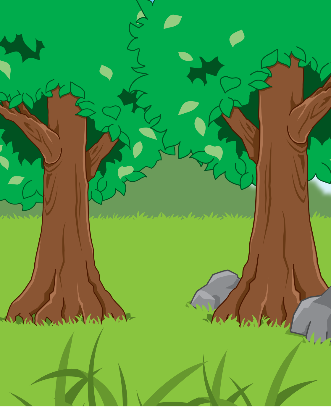
How many monkeys are there?