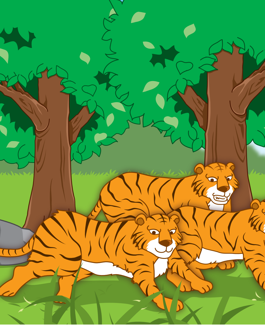
How many tigers are there?