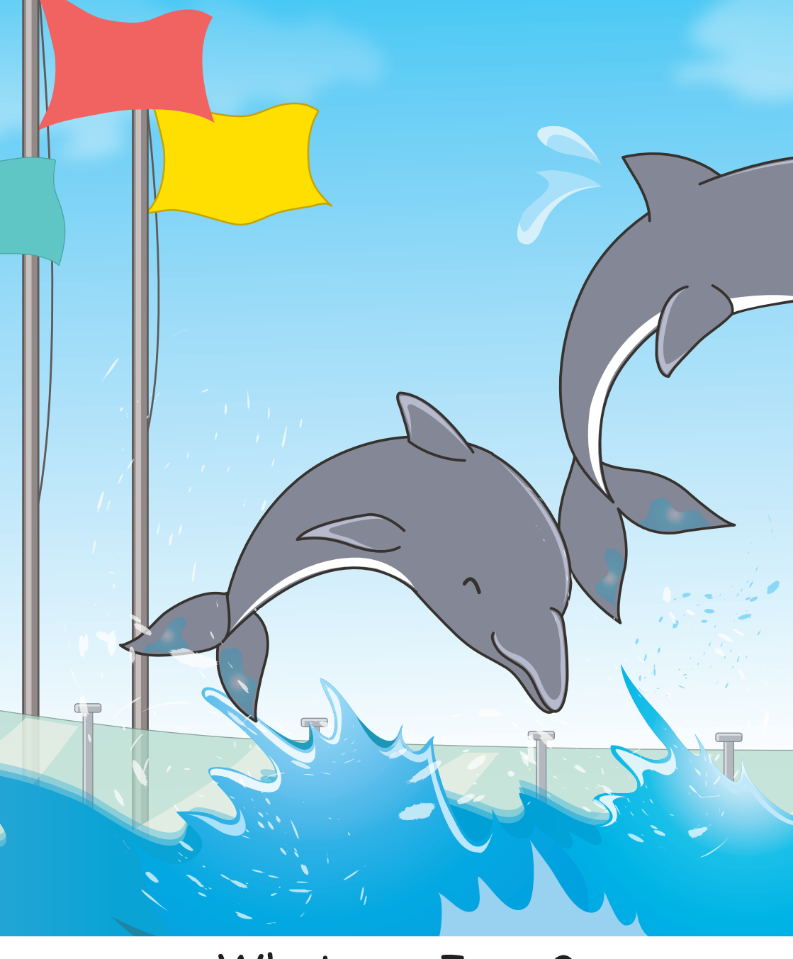
What can I see?