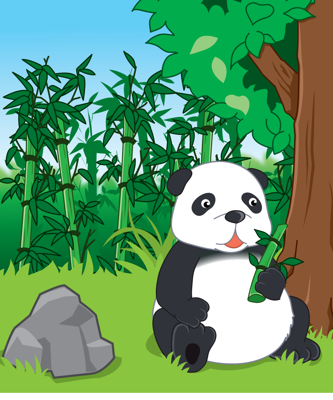
What can I see?