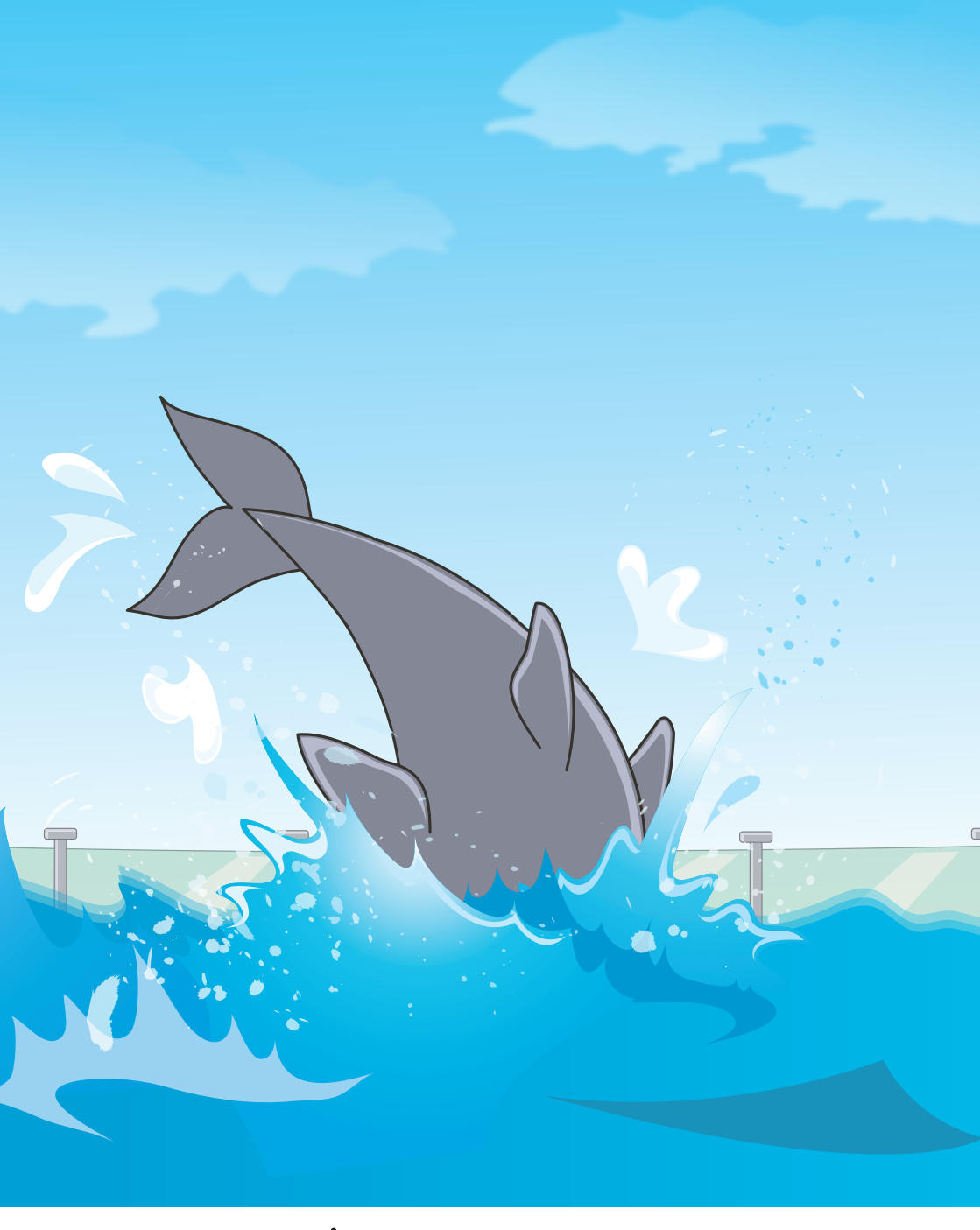
What can I see?