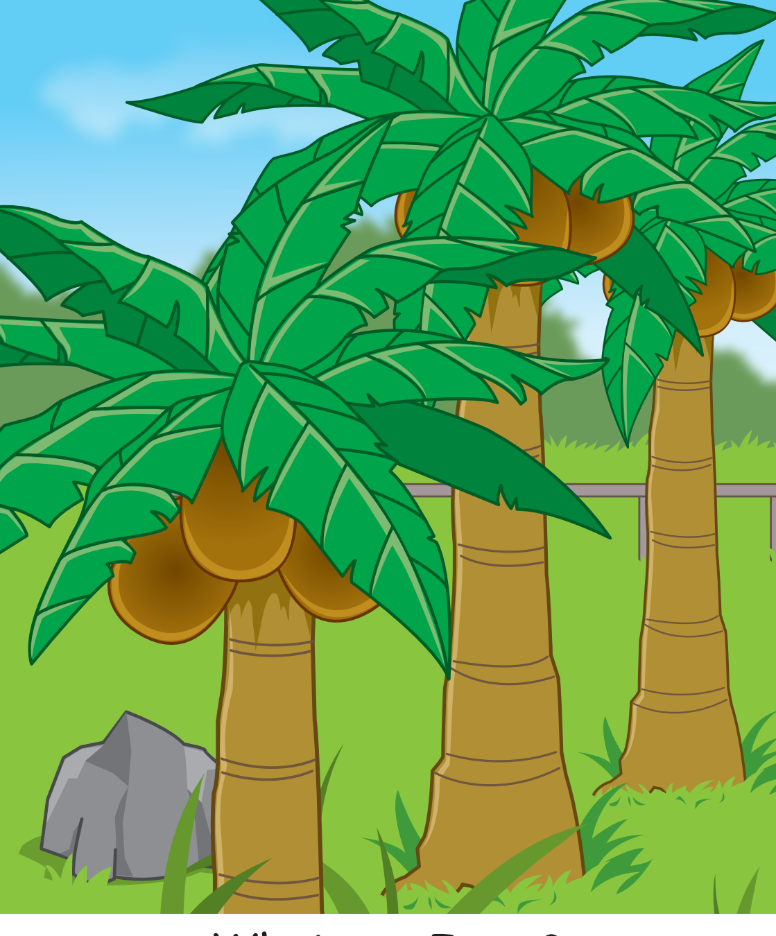
What can I see?