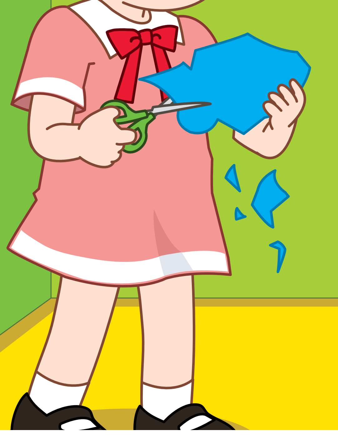
Cut out the blue eyes.