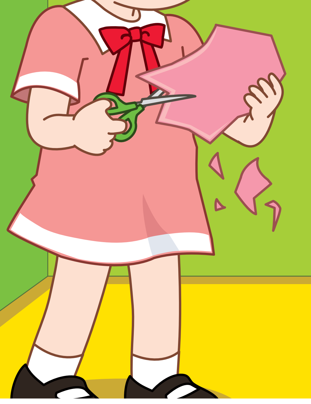
Cut out the pink ears.